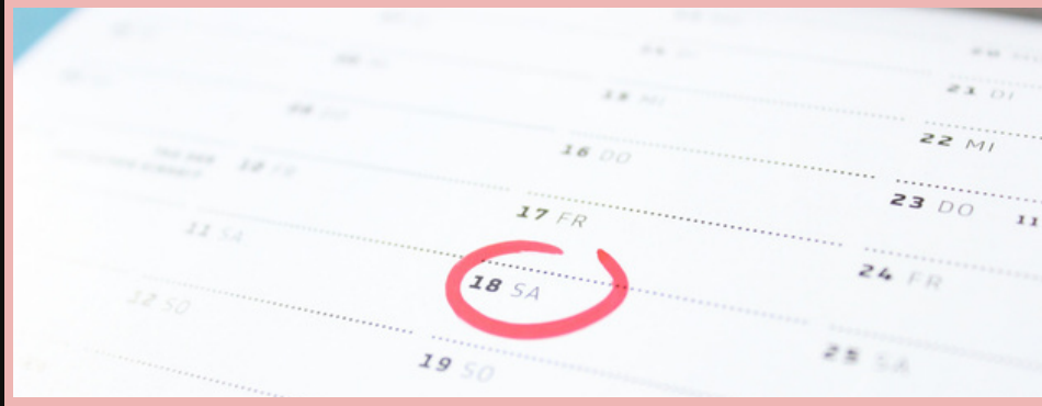
Appointment Setting & Calendar Management