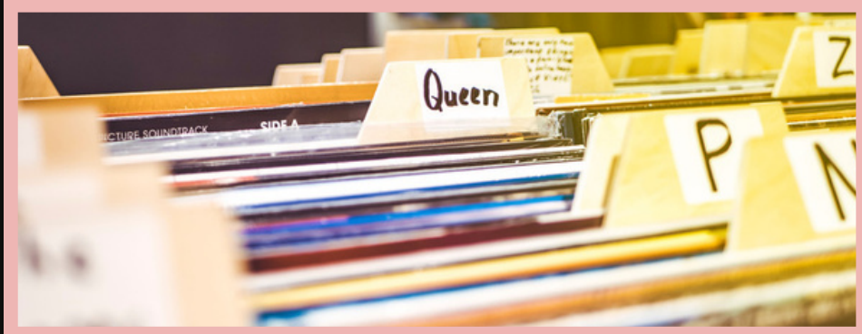
Forms & Files Management